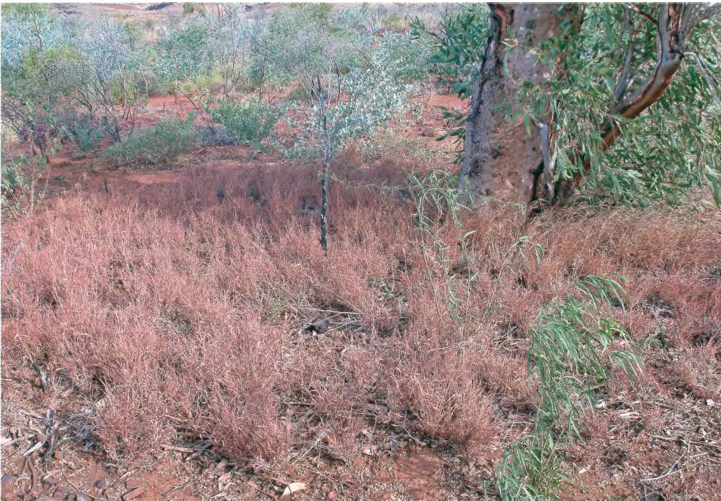
Fig. 7. Eulalia simonii , showing tussocks that are linked by rhizomes ( cf. Fig. 8 ), the reddish colour that its leaves turn to as the environment dries and the habitat on the narrow floodplain of a creek, c. 70 km NW of Wittennoom.

Etymology: The new species is named for the late Bryan Simon (1943–2015) who made significant contributions to the taxonomy of Australian grasses during his long and successful career.